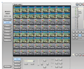
< CMS >