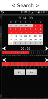
< Mobile >